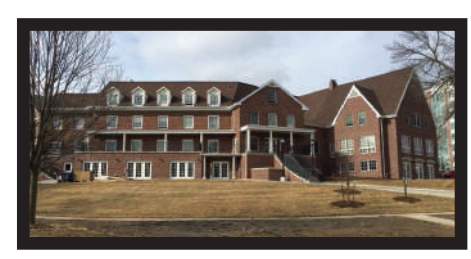
Alpha Gamma Rho Eta Chapter, Iowa State University 201 Gray Avenue Ames, Iowa 50014

Please update your email with Eta Chapter AGR! If you haven't been receiving emails from us containing important event information and chapter updates, please send us your email address to jermier9@iastate.edu